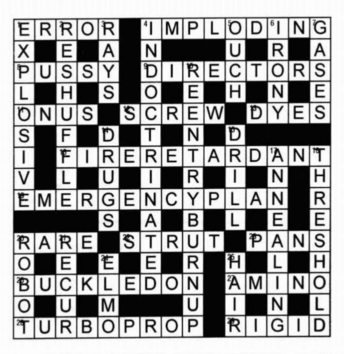
ANSWERS TO NO. 4 CROSSWORD PUZZLE