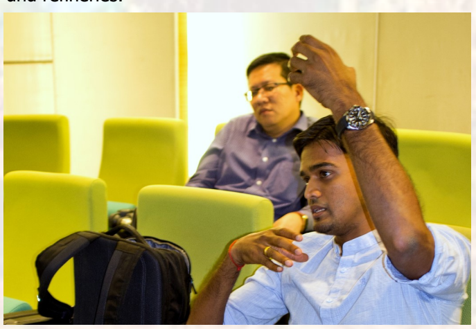
The Q&A session was lively centering on the new technologies including the ice condensing vacuum system.

Although 3-MCPD and GE are formed in the refining stages, the precursors are from the CPO quality. The advancements of refining technologies in mitigating 3-MCPD and GE will only work as good as the CPO quality provided. The solution to this problem will only be successful with the joint efforts of the plantation, mill and refineries.