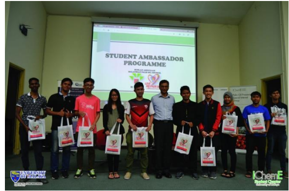
The ten who volunteered to be Love MY Palm Oil Student Ambassadors.