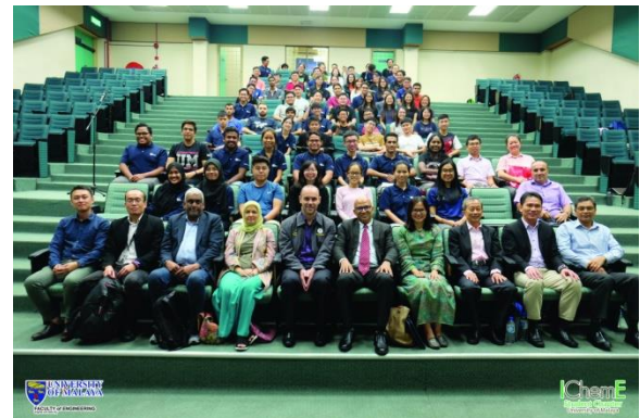
The group photo of all the speakers and participants.