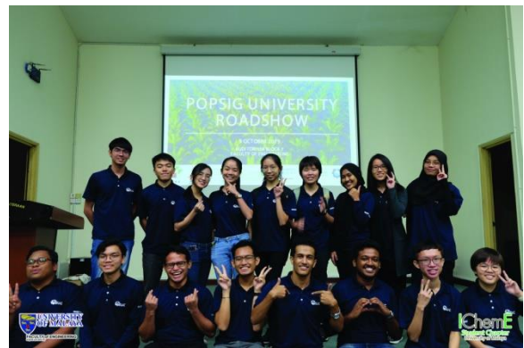
Great organization by the IChemE Student Chapter University of Malaya.