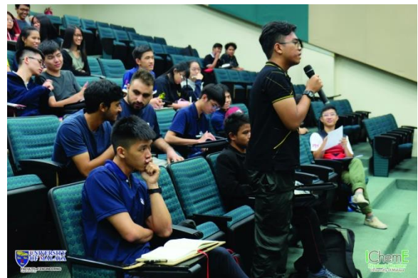
A question from a mechanical engineering undergraduate.