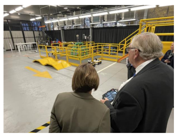
Figure 9 – Government of W.A.