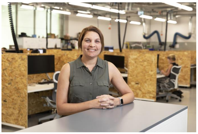
Figure 8 - Source: Woodside

Advances in the Digitalisation of the Process Industries