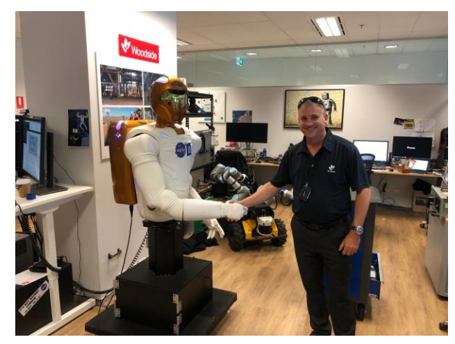
Figure 7 - Source: Woodside