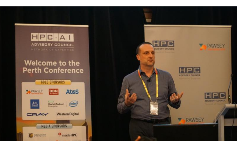
Figure 2 - Source: HPC Australia