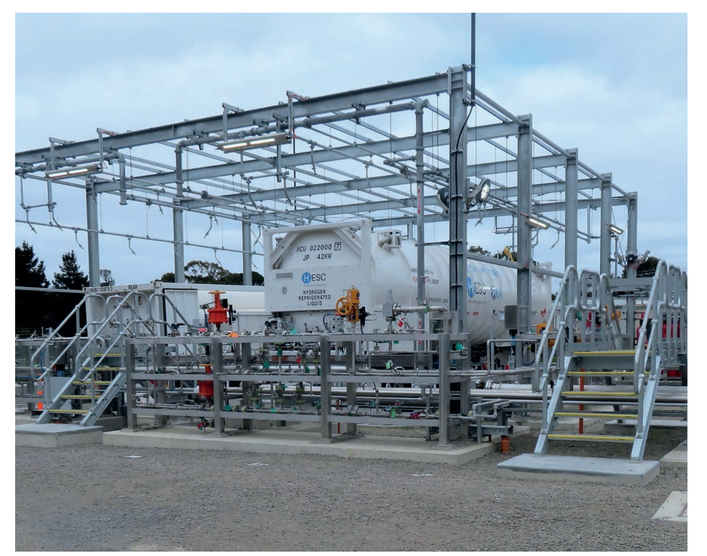
Pilot scale hydrogen production project in Hastings, Victoria, Australia

This means including these sectors in the pilot projects aimed at scaling up hydrogen production, storage and end-uses, and increasing the products, markets, skills and knowledge base needed to do so. Pilot projects and any further roll out of hydrogen technologies should be partnered with public engagement aimed at developing people's understanding of this new energy vector and its use in the sectors where it is adopted. This will allow these otherwise hard-to-decarbonise sectors to take advantage of the increasing availability of hydrogen, achieve immediate emission reduction and be a successful part of the net zero transition.