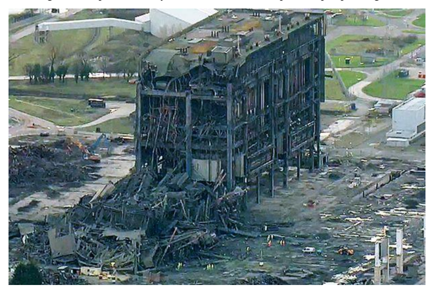
Figure 1: Didcot A Power Station Collapse. UK - 2016.

Incidents such as the structural collapse at the Didcot A Power Station in 2016 (see Figure 1), provide a stark reminder that the need for effective management of process safety does not end when the plant stops operating.