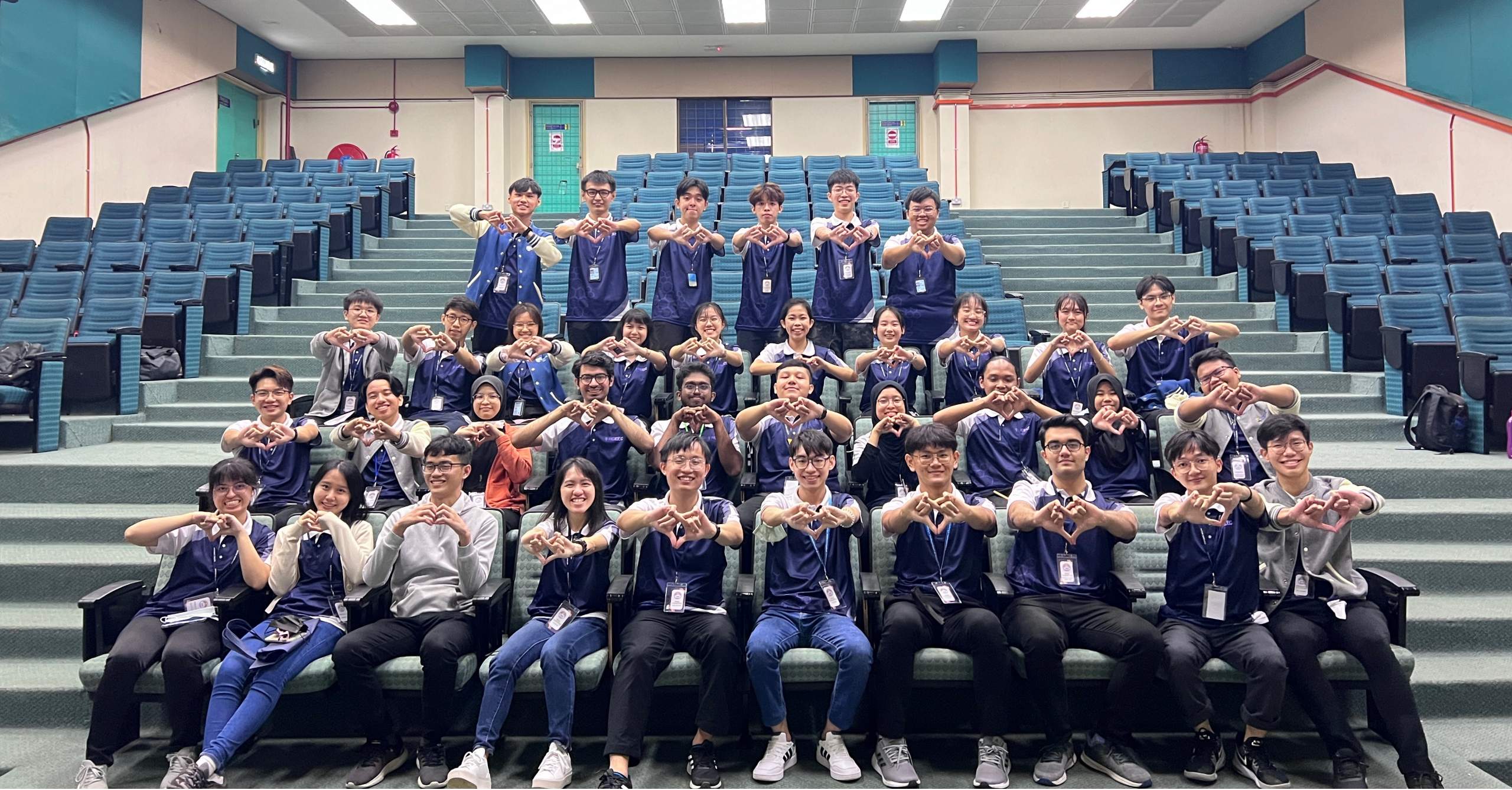
NCEEC 2023 committee group photo