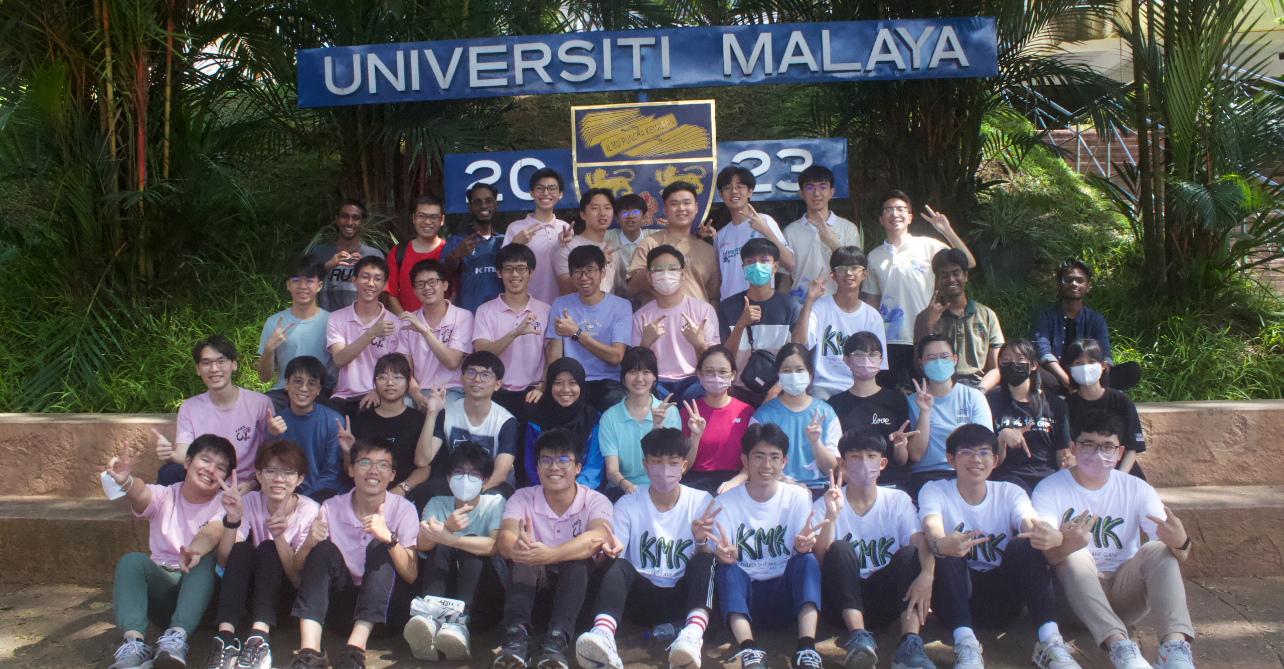
Group photo in Universiti Malaya