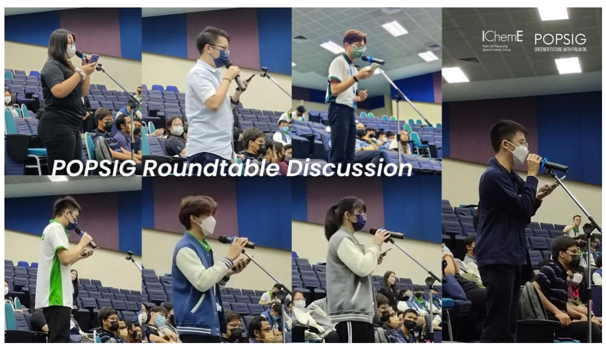
Figure 4: The students expressed their views and suggestions to the panel about the latest development in the palm oil industry.