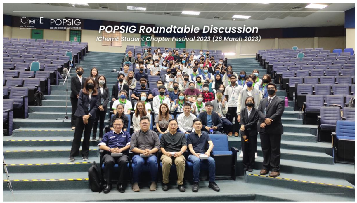
Figure 2: Group photo session in Universiti Malaya.