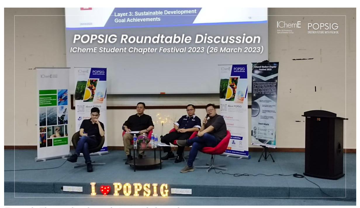
Figure 3: The panel exchanged views with the students.