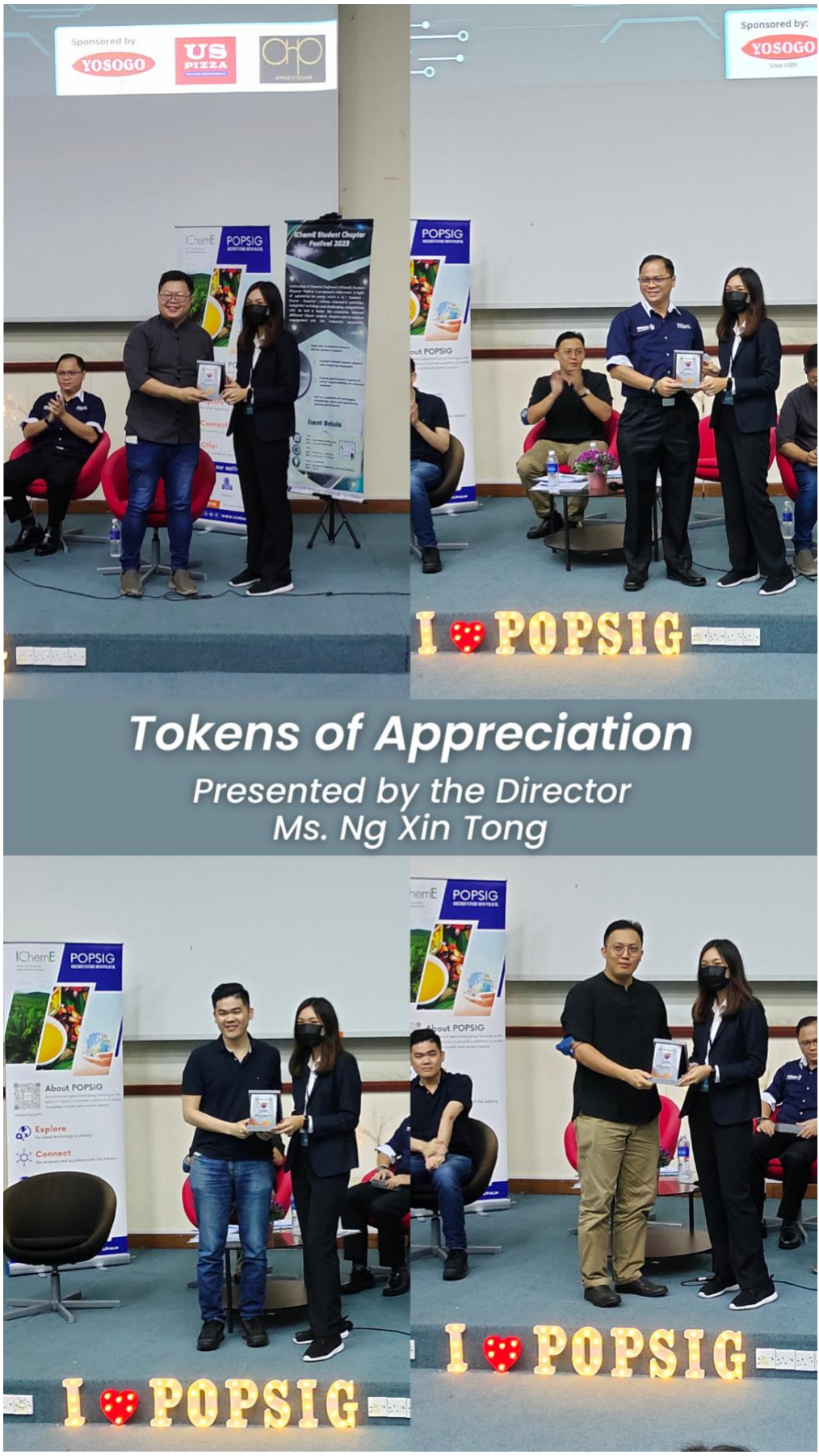
Figure 5: The tokens of appreciation were presented by Ms Ng Xin Tong to the panellists.