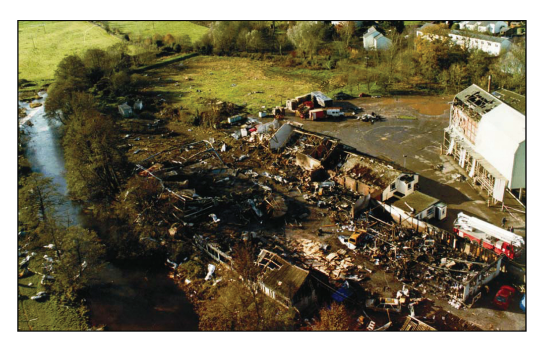
Figure 2. Uffculme fireworks complex after incident

Research into firework storage in ISO-containers that was being performed at HSL<sup>(6)</sup> at the time of the incident produced visual effects similar to those observed at the incident scene (Figure 3). A total of 2.6 tonnes NEC of firework