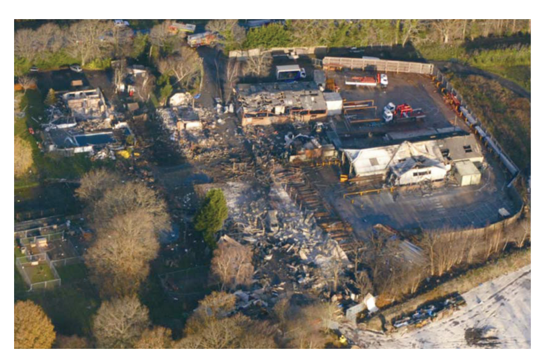
Figure 4. Festival Fireworks Ltd storage complex after incident

large-scale storage might have reacted more violently than would have been expected from the standard UN classification tests, where limited quantities are tested. Similar concerns applied after the Uffculme incident. HSE had already commissioned work with HSL<sup>(6)</sup> before that incident occurred and as a result both organisations were instrumental in bringing about a multi-national European Union funded research programme referred to as 'CHAF' (Quantification and control of the Hazards Associated with the transport and bulk storage of Fireworks), which was set up between Germany (BAM), The Netherlands (TNO) and the United Kingdom (HSL) after the Enschede incident. This collaborative work concluded that in the vast majority of cases the Hazard Division predicted by the UN tests correctly predicted behaviour in large-scale stores but identified some significant exceptions.