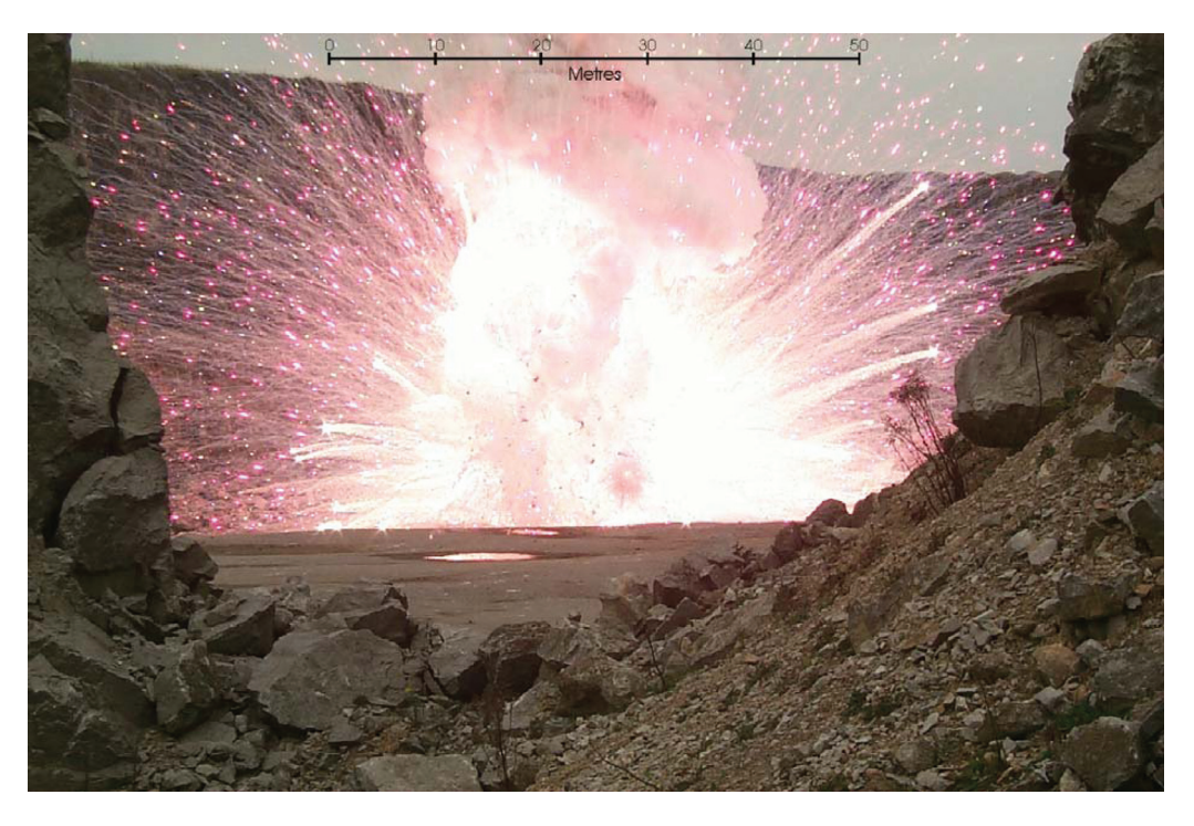
Figure 3. Effects of ignition of 2.6 tonnes NEC of firework shells in a 20 ft steel ISO transport container

shells, caused the doors of the container to burst open and the container sides to bulge. The shells ignited sequentially over a 20 second period and produced a sphere of stars in excess of 100 m diameter. An inner core of flame 36 m diameter was estimated to have an effective surface temperature of 400°C and exceeded 800°C over a diameter of 22 m.