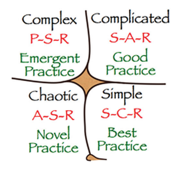
Figure 1. Cynefin complexity framework

Most of the learning initiatives outlined in Table 1 are focused on dissemination of good/best practices. Although these approaches are very useful as a means of sharing